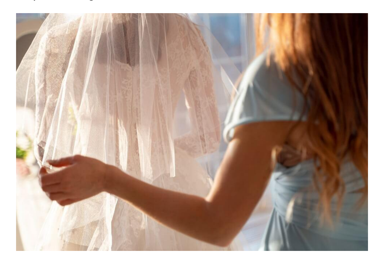
#Step 1 - Assessing the Construction and Material:

Checking the material and construction of your bridal veil is the first step in cleaning and conserving it. There are many various types of veil fabrics, such as satin, tulle, lace, and silk, and each one requires a unique cleaning method. Furthermore, take into account any embellishments on the veil, including embroidery, sequins, or beading, as these could affect how it is cleaned. In order to prevent damage, having your veil professionally cleaned can be the best choice if it has complex detailing or is extremely filthy.